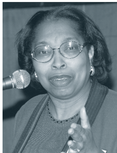
Hon. Bernice B. Donald

Since its inception, the Workshop has aimed to bring together experienced judges with practitioners and academics to tailor the discussion to federal judges’ needs, and to provide guidance and time for reframing is-