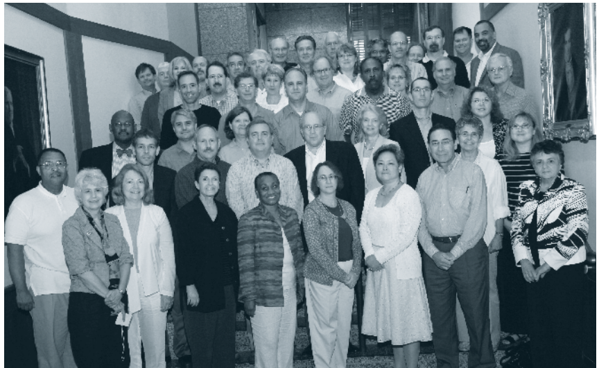
Faculty and attendees of the New Appellate Judges Seminar