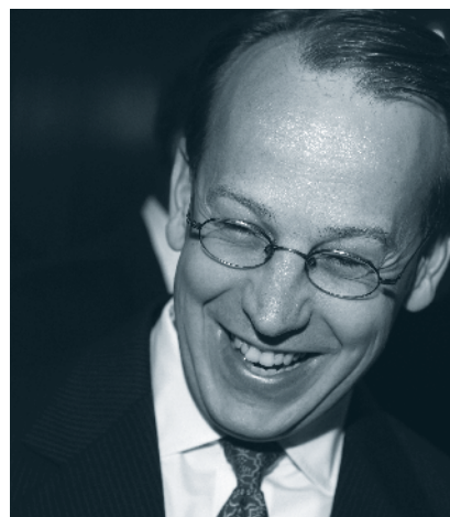
Solicitor General Paul D. Clement