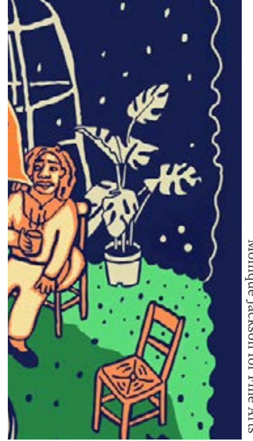
Monique Jackson for Fine Arts

WHO IS SITTING AT YOUR TABLE, SKETCHING OUT THE PAR PROCESS WITH YOU?