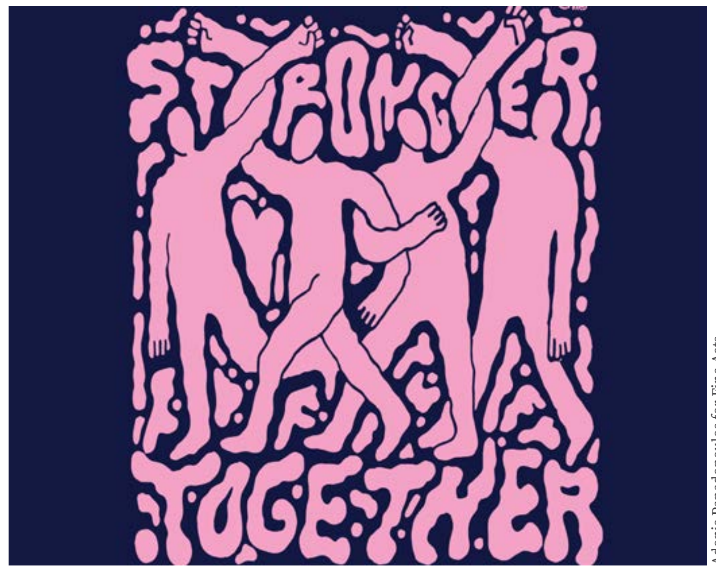
Adonis Papadopoulos for Fine Acts