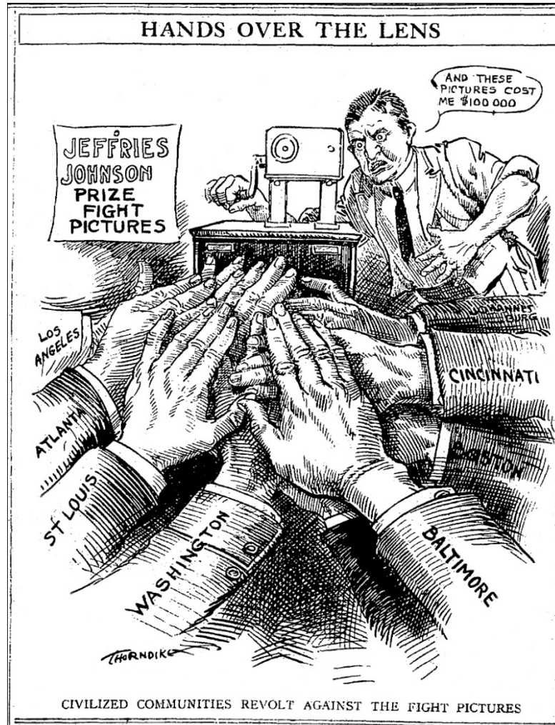
A cartoon depicting the spread bans on the Johnson-Jeffries Fight Film in major cities across the country.

The Baltimore American , July 7, 1910, at 16