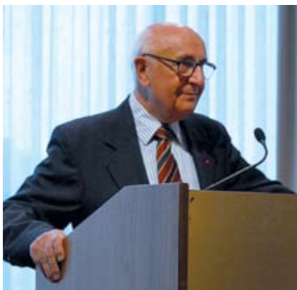
THEODOR MERON

Meron attributed his success largely to "chance and seized opportunity," but his belief that crimes against humanity can be avoided is also a factor. He cited from his 2006 book, Humanization of International Law : "It seemed to me obvious that repression of human dignity occurs in a continuum of situations of strife, ranging from normality to full blown international wars, and that all these norms must be treated as a whole to provide for a maximum of protection to human beings." □