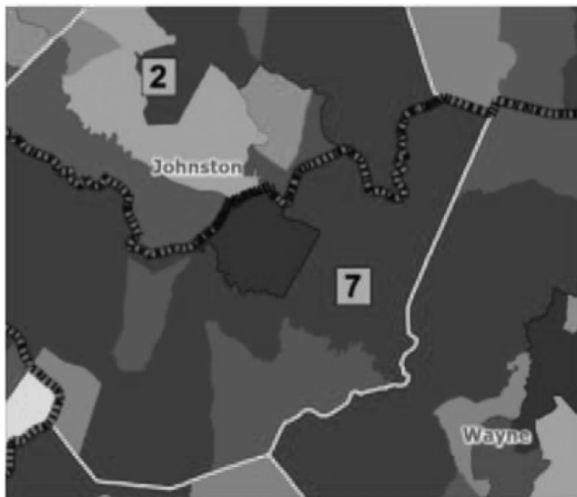
Figure 5: The cracking of Johnston County between Districts 2 and 7

To achieve the goal of diluting Democratic voter strength in District 7, the district divides municipalities and communities of interest along partisan lines. For example, the northwestern edge of District 7 splits Johnston County in two—cracking the county’s large cluster of historically Democratic precincts into near-equal halves between Districts 7 and 2. Ex. 4011. Similarly, the southwestern edge of District 7 splits Bladen County by meandering around more than half of the county’s disproportionately Democratic precincts to draw those districts into District 7, while retaining the remaining precincts in District 9. Ex. 4007.