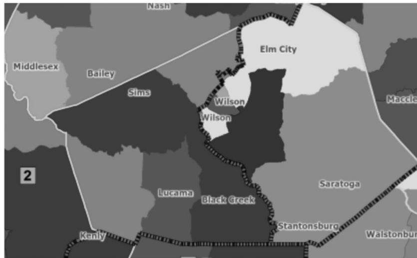
Figure 2: The partisan division of Wilson County between Districts 1 and 2 46

To achieve the goal of concentrating Democratic voters in District 1, the 2016 Plan divides municipalities and communities of interest along partisan lines. For example, the southwestern edge of District 1 splits Wilson County by packing the county's large cluster of historically Democratic precincts into District 1, while placing the county's historically Republican precincts into District 2. Ex. 4015. Similarly, the southern edge of District 1 splits Pitt County by placing that county's disproportionately Democratic precincts into District 1 while placing the disproportionately Republican precincts into District 3. Ex. 4013.