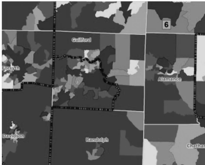
Figure 4: The cracking of Guilford County between Districts 6 and 13

the city's large cluster of historically Democratic precincts into District 6 and placing the other half into District 13. Ex. 4010. Significantly, Legislative Defendants' expert , Dr. Hood, testified that line drawn through Guilford County separating Districts 6 and 13 constituted "legislative cracking of a Democratic partisan cluster in the redistricting process." Trial Tr. IV, at 45:2–8. Dr. Hood further testified that had the mapdrawers not cracked Guilford County, one of the two districts "would have been more Democratic." Id. at 45:24–46:5.