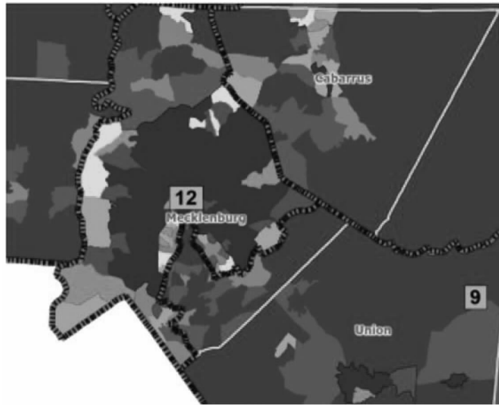
Figure 8: The partisan division of Mecklenburg County between Districts 9 and 12

Although any map drawn to comply with the one-person, one-vote requirement must divide Mecklenburg County, numerous alternative maps drawn by the panel of retired judges and generated Plaintiffs' experts, including Plan 2-297, demonstrate that the General Assembly could have drawn District 12 without hewing exactly to the line formed between the Democratic and Republican precincts in Mecklenburg County, as the 2016 Plan does. Compare, e.g., Second Chen Decl. 3; Exs. 5025–27, 5095, with Ex. 4012. Notably, the district, like District 12, wholly contained in Mecklenburg County in Plan 2-297, District 3, has a significantly lower predicted Democratic vote share, as measured by Dr. Hoffeller's partisanship variable, than that observed in District 12. Compare Second Chen Decl. 5 (expected Democratic vote share of 54.18%), with Ex. 1018, at 2 (Democratic candidate received 67% of the vote in 2016 election).