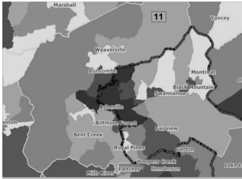
Figure 7: The cracking of Buncombe County between Districts 10 and 11

Significantly, Dr. Hofeller created several alternative maps that did not split the Buncombe County Democratic cluster. Ex. 2004, at 11, 13, 18. And not a single map drawn by the retired judges splits Buncombe County at all , let alone through the middle of the Democratic cluster. Ex. 5095; cf. Lewis Dep. 64:25–65:1 (testifying he “couldn’t ever figure out a way” to “keep Buncombe county whole”). Likewise, numerous alternative maps generated by Plaintiffs’ experts, including Plan 2-297, demonstrate that the General Assembly could have drawn District 10 without cracking the Democratic cluster in Buncombe County. E.g. , Second Chen Decl. 3, Exs. 5025–27. Notably, Districts 1 and 2 in Plan 2-297, which contain most of the area encompassed by Districts 10 and 11 in the 2016 Plan, are, on average, significantly more compact than District 10 and 11 of the 2016 Plan, as measured by the General Assembly’s preferred Reock and Polsby-Popper metrics. Compare Second Chen Decl. 3–5 (reporting Reock and Polsby-