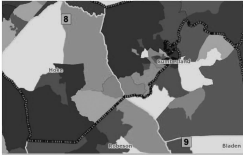
Figure 6: The cracking of Cumberland County between Districts 8 and 9

Dr. Hofeller created at least one alternative map that left Cumberland County whole. See, e.g. , Ex. 2004, at 14. Several other maps generated by Plaintiffs' experts—including Plan 2-297—did not divide Cumberland County, e.g. , Second Chen Decl. 3; Ex. 5029, or crack the Cumberland-Hoke-Robeson County cluster, e.g. , Exs. 5026, 5033. Also unlike the 2016 Plan, numerous maps generated by Plaintiffs' experts—including Plan 2-297—do not place Cabarrus County and the Cumberland-Hoke-Robeson County grouping, which lie in different political subregions of the State, in the same district. E.g. , Second Chen Decl. 3; Exs. 5025–27. Additionally, although none of the districts in Plan 2-297 take on District 8's serpentine-shape, the district in Plan 2-297 that includes most of the Cumberland-Hoke-Robeson County cluster, District 8, has a substantially lower Republican vote share as measured by Dr. Hofeller's variable than District 8 in the 2016 Plan. Compare Second Chen Decl. 5 (expected Republican vote share of 46.43%), with Ex. 1018, at 3 (Republican candidate received 58.8% of the vote in 2016 election).