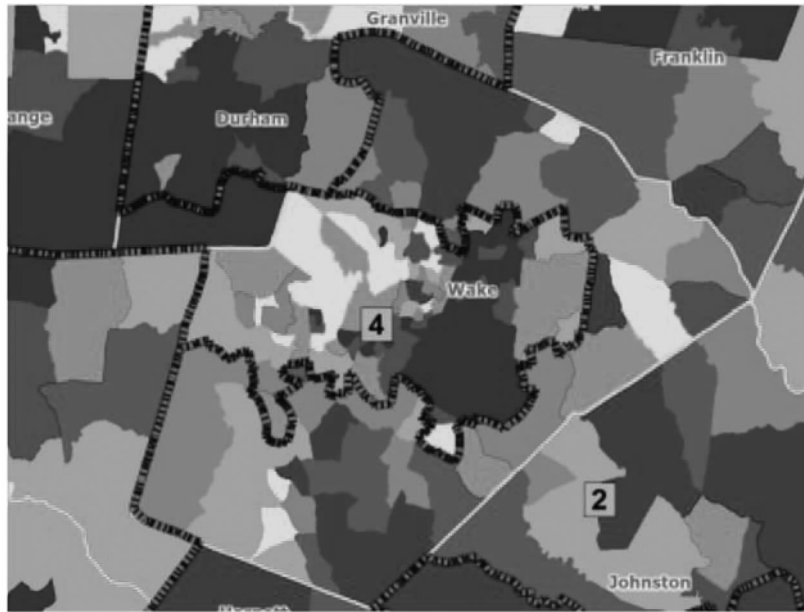
Figure 3: The partisan division of Wake County between Districts 2 and 4