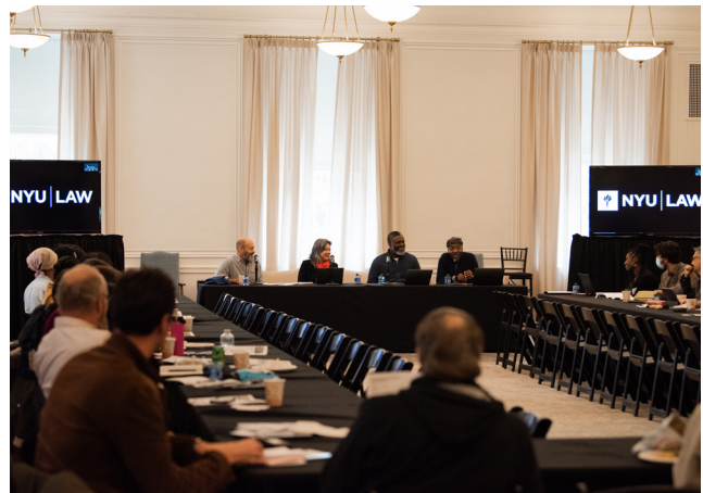
NYU Law hosted students, scholars, and community members for the "Dismantling Racial Capitalism" symposium.