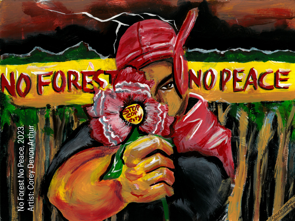
No Forest No Peace, 2023. Artist: Corey Devon Arthur