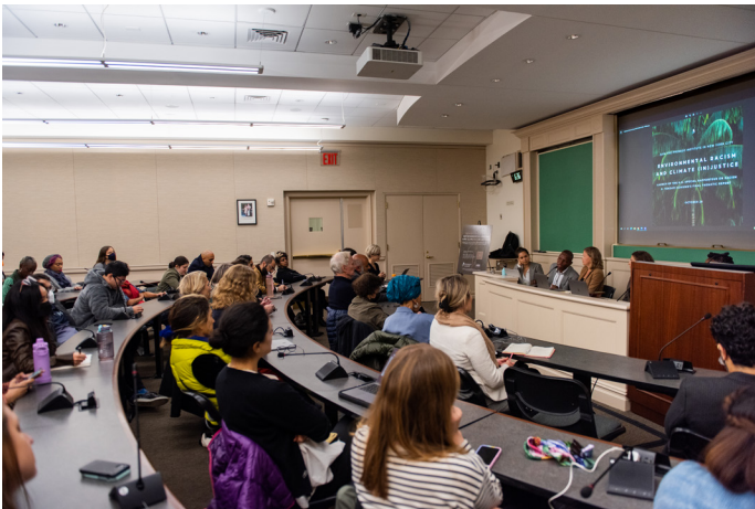
The Center co-hosted “Environmental Racism and Climate (In) Justice” in partnership with the Promise Institute and numerous organizations at NYU Law.

structural racism today. The event was hosted in partnership with the Global Justice Clinic at NYU Law; the Guarini Center on Environmental, Energy, and Land Use Law at NYU Law; the Center for Human Rights and Global Justice at NYU Law; and the Promise Institute.