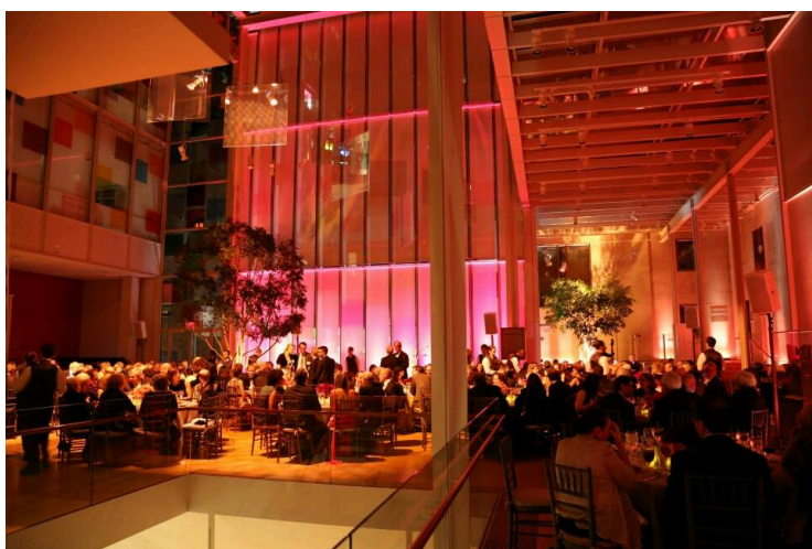
Weinfeld members enjoy dinner at the annual Weinfeld Gala, held this year at the Morgan Library & Museum. Past locations include the Metropolitan Museum of Art and the Mandarin Oriental Hotel.