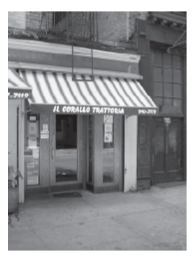
Il Corallo Trattoria (176 Prince b/w Thompson & Sullivan): Charming Italian in Soho with affordable lunch specials.

Solid food/beverage choice; packed with the student/village crowd; can be very smoky; open 24 hours.