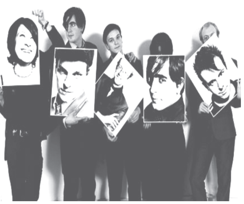
As can be seen, Art Brut toes the line between serious and tongue-in-cheek

While the seriousness of their seemingly silly songs is almost completely lost in recorded form, watching Art Brut live reveals that Argos is certainly emo-