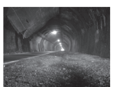
The vice dean's tunnel.

A nervous quiet reigns throughout the JILP office, the probable location for the vice dean's looming breach. "We know it's coming," sighed one editor fatalistically as she gestured toward the cracking north wall. "But when? After he takes away our journal credit? Before he retires? Since we editors really don't do any work anyway, all we can do