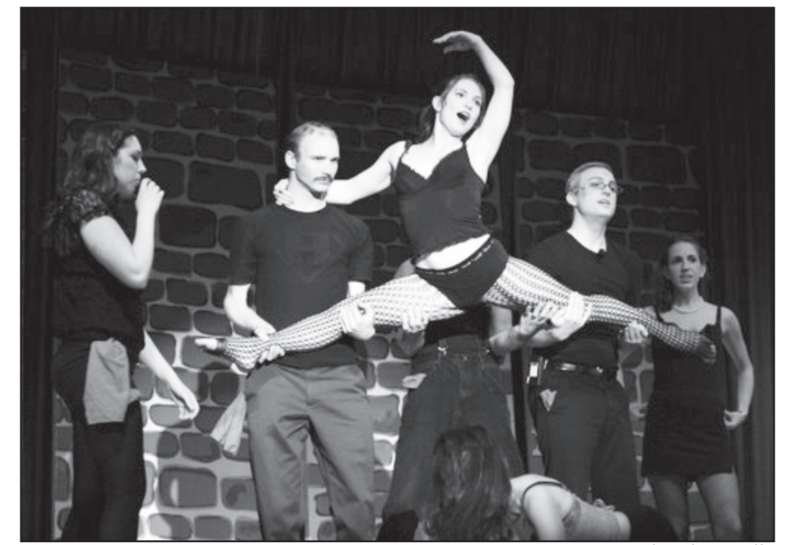
The Commentator was shocked to learn that we were mocked during this year's Law Revue musical. We considered leaving in a huff, but instead merely huffed and watched the remainder of the play.