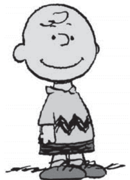
Charlie Brown, another nice guy