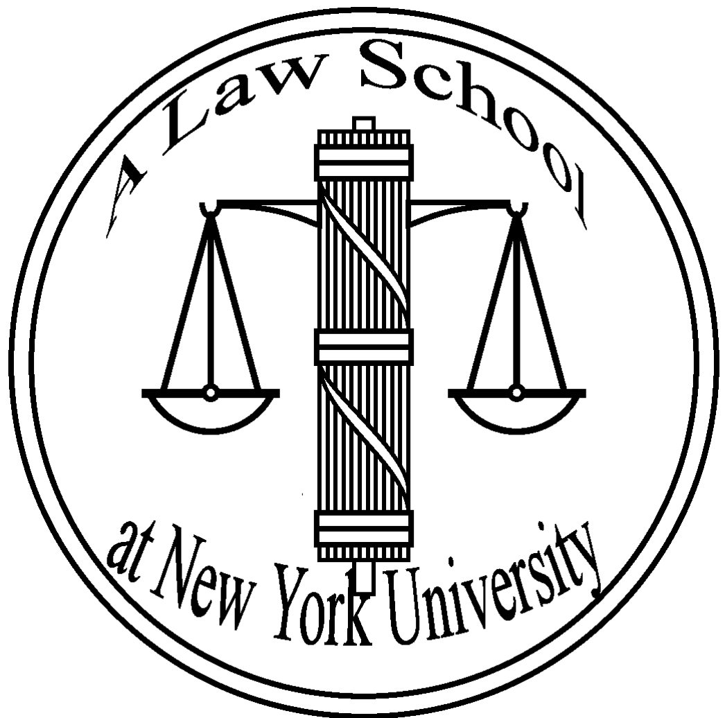
Not the Docket Artist Rendering of the new logo. Maybe NYU will do a better job