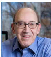
George Borjas Robert W. Scrivner Professor of Economics and Social Policy, Harvard Kennedy School [Click here to view bio]