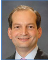
Hon. R. Alex Acosta U.S. Secretary of Labor [Click here to view bio]