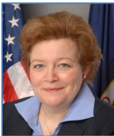
Hon. Victoria A. Lipnic Acting Chair, U.S. Equal Employment Opportunity Commission [Click here to view bio]