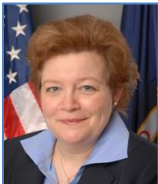
Hon. Victoria A. Lipnic Acting Chair, U.S. Equal Employment Opportunity Commission [Click here to view bio]