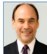
Douglas Holtz-Eakin President, American Action Forum; former Chief Economist, President George W. Bush's Council of Economic Advisers [Click here to view bio]