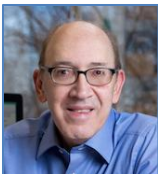
George Borjas Robert W. Scrivner Professor of Economics and Social Policy, Harvard Kennedy School [Click here to view bio]