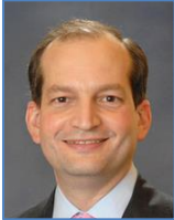
Hon. R. Alex Acosta U.S. Secretary of Labor (Invited) [Click to view bio]